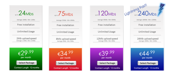
Figure 2. Example broadband packages for participants in the pseudo-technical condition.

After participants chose a provider, Stage 2 presented four packages in ascending order of price and maximum download speed (Figure 2). There was one between-groups manipulation: participants were randomly assigned to see the fastest, most expensive package advertised with a pseudo-technical label (n = 130), a standard marketing label (n = 126) or no label (n = 111). Their task was again to choose as they would in real life.