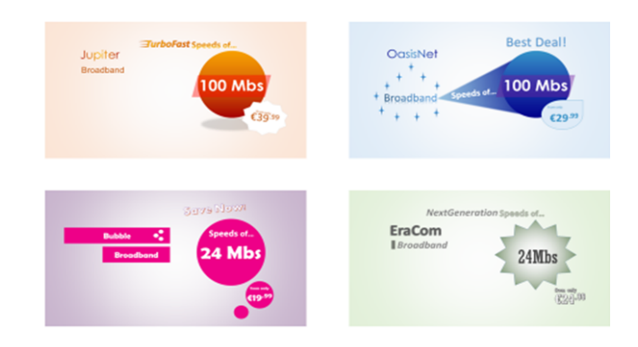
Figure 1. Example broadband provider choice screen in the unbundled condition.

Please choose one of the following broadband providers: